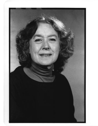
DOROTHY - A Tribute.